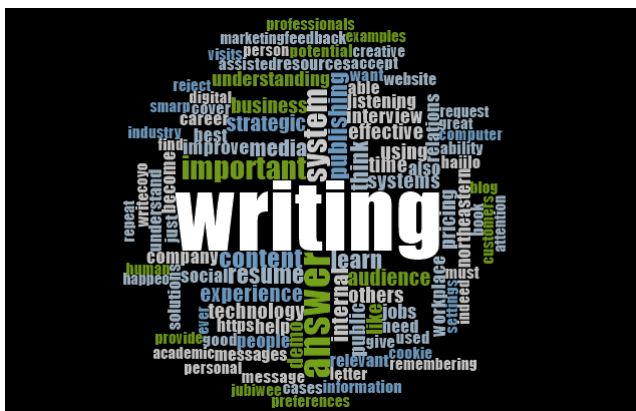
Figure 1 Word cloud

Word Frequency Query: A Word Frequency query is a data analysis technique employed in qualitative research using software like NVivo. It assists researchers in identifying the most frequently occurring words or phrases within a dataset, offering a comprehensive overview of the most prevalent themes, concepts, or language patterns in the qualitative data. This method helps researchers discern common themes and prominent ideas, making it a valuable tool for initial data exploration and hypothesis generation, as it highlights the most frequently encountered terms within the dataset. The results are shown in Figure 1. It indicates that writing is important in our life.