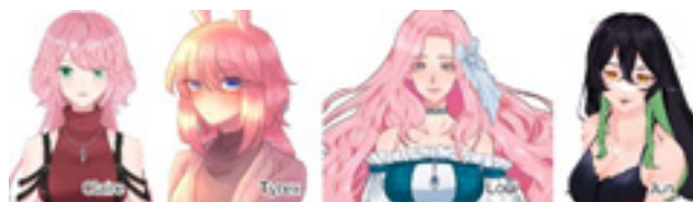
Figure 3 Characters Original Design

about the virtual personas they have created to represent themselves in the world of online communities. Writers then use the details they have been given as references to create personal interpretations of their personas, and also use them to imagine how their characters would act and express themselves in various settings or specific events.