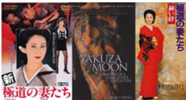
Figure 2 sample: A, Yakuza Ladies revisited , 1991 (Toei Company). Sample B, Yakuza Moon by Shoko Tendo. Sample C Yakuza Ladies: Blood Ties 1995 (Toei Company)

episode that is based on Japanese Yakuza culture. To achieve this, the author analyzes the culture, such as how the Yakuza have a hierarchy system almost like a family. The author based the setting of this episode in Japan, which causes the clothing and environment to have a feel that is identical to Japan.