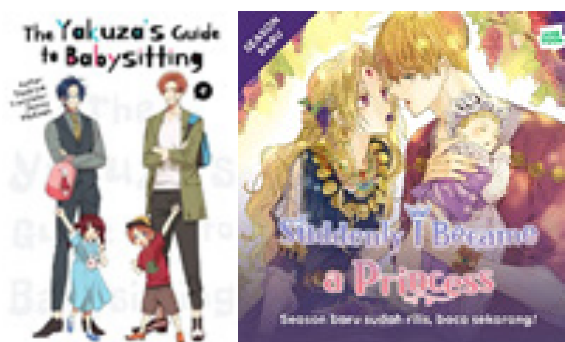
Figure 1 sample: A, The Yakuza's Guide to Babysitting by Tsukiya. Sample B, Suddenly I Became a Princess by Plutus and Spoon

The author uses an analysis method for several webtoons and anime that have similar genres as a reference for designing the layout and storyline. The author uses a canvas size that matches the size determined by the webtoon and adjusts the layout so that it can be read from top to bottom. The author also uses several aspects of anime as a source of inspiration for the storyline and genre design.