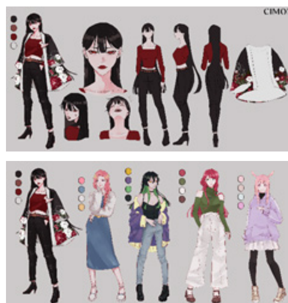
Figure 4 A. Cimon's Character Study. B. Character Design Results

The author's first step in redesigning a character is to observe the original design then redraw their design with a personal interpretation according to the key points from the initial visual design, then design clothing according to the character's story background. Next, the author makes a character study of those characters and uses it as a benchmark when designing the webtoon in the future.